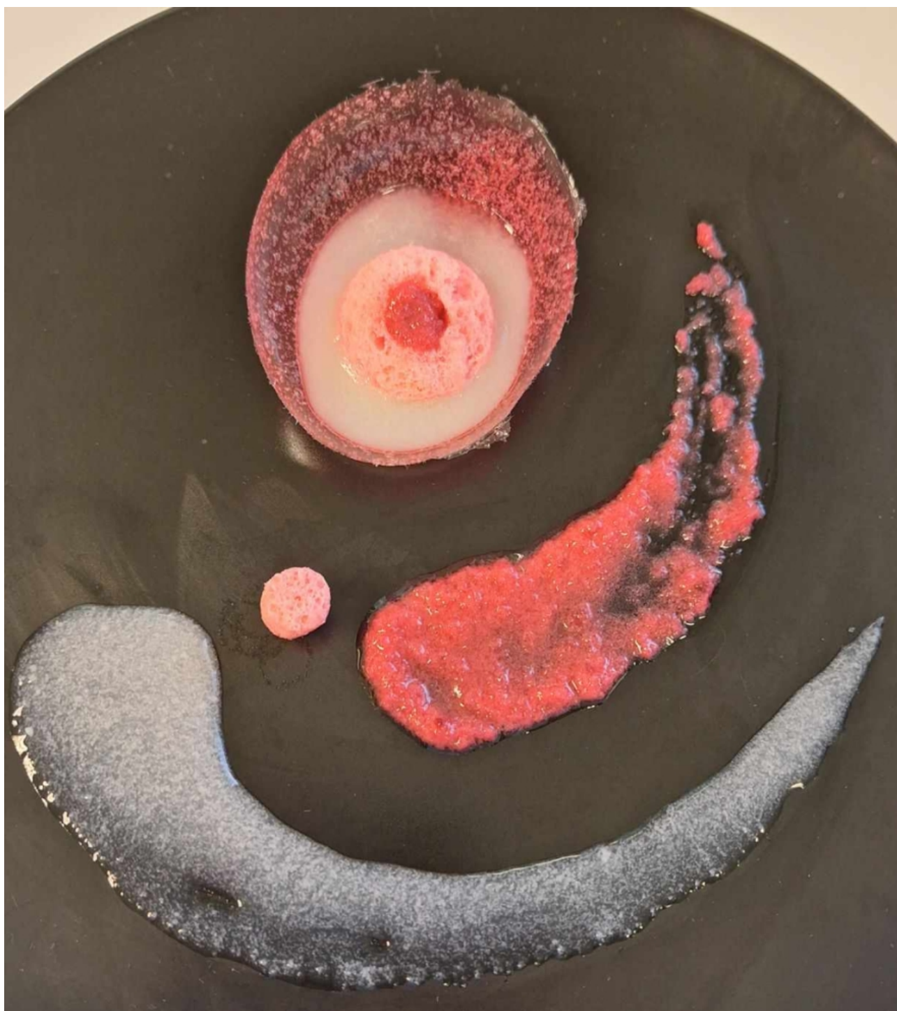
Figure 2. The final dish "La vie en rose".