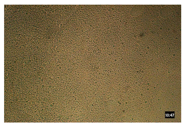
Figure 1. Egg yolk is made of granules (size ranging from 0.3 to 2 \mu m) dispersed in a plasma (H. This).

For example, Colombié (1893) wrote [personal translation]: "If the sauce was to fail, one can regenerate it again by adding a teaspoon of cold water". Gilbert (1898b) gave the same kind of culinary precision [personal translation]: "If, on the