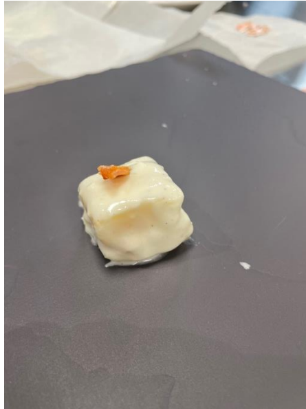
Figure 2: Decoration No2.

This decoration was fancier, especially when someone tried to cut the cube, because it had particles of crispy bacon in the center. Although, the all the manipulations needed to prepare the plate, led to an uneven final shape, that should be fixed in case we choose to present the plate in this format.