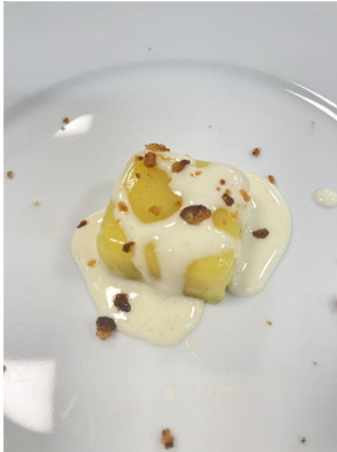
Figure 4: The result of the second trial.