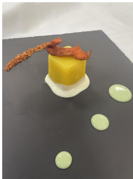
Figure 6: The final dish.

The preparations that made as described above, were easily handled to create this dish. Firstly, the potato cube was emerged in the cream cheese and put in the middle of a black plate. On the top a bacon crisp was put. On the one side of the dish the green-coloured cream cheese was put in a circular shape, while on the other the bacon powder.