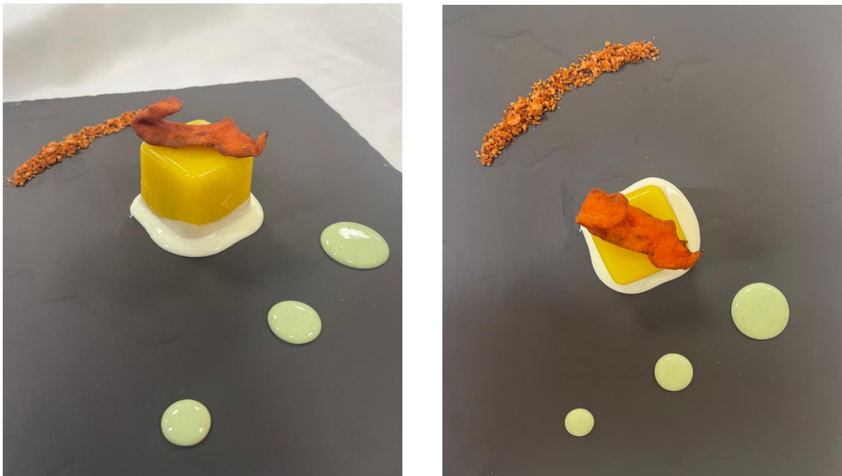
Figure 3: The final dish.

The preparations made as described above and a dark grey plate was used for the final presentation. Firstly, the potato cube was emerged in the cream cheese and put in the middle of the plate. On the top a bacon crisp was put. On the one side of the dish the green-coloured cream cheese was put in a circular shape, while on the other the bacon powder. The final result is shown in Figure 3.