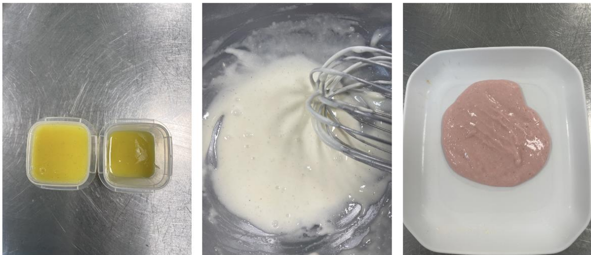
Figure 2: Potato cubes in molds (left), cream cheese in the whipping step (middle), crispy bacon's dough preparation (right).