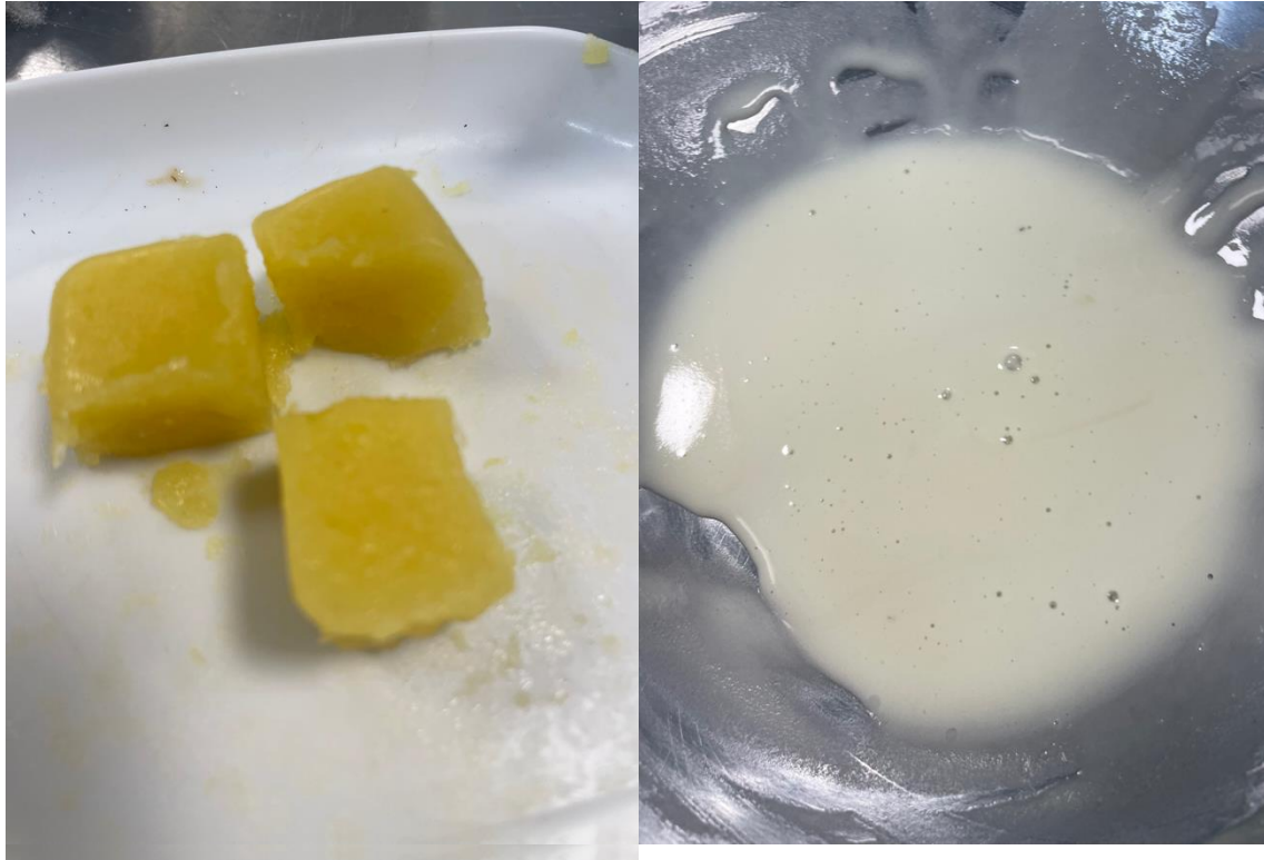
Figure 2: Potato cubes (left) and cream cheese (right).