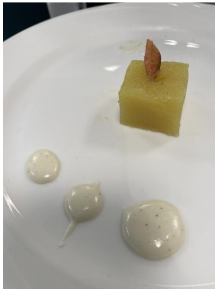
Figure 5: Decoration No1.

Even the taste was good, the final decoration was not attractive because there was not contrast in the plate.